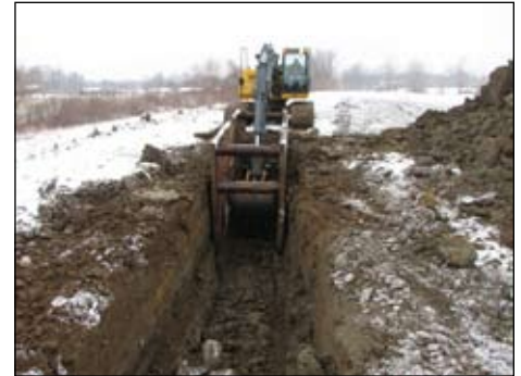
Apprentice Cele Cvetkoski during Trenchbox safety class.