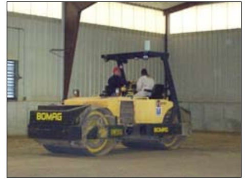
Instructor Les Wyss (AKA Bucket) teaches rolling patterns during asphalt class 2009.

All in all work is pretty good on the west side of Indy; we just need some good dry weather.