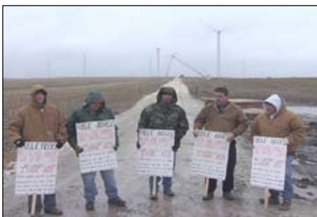
District 3 operators picket Mullens Crane & Transport.

The Hoosier Heartland project has finally started on the east side of Tippecanoe County. Walsh is working on two overpasses with Crider and Crider moving the dirt. Milestone was