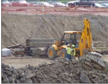
Beaty doing the shoring at Parkview Hospital.

Shook Construction has some nice sewer treatment plant work this year on three plants located at the Grissom Air Force Base, Tipton and Kokomo. 3D