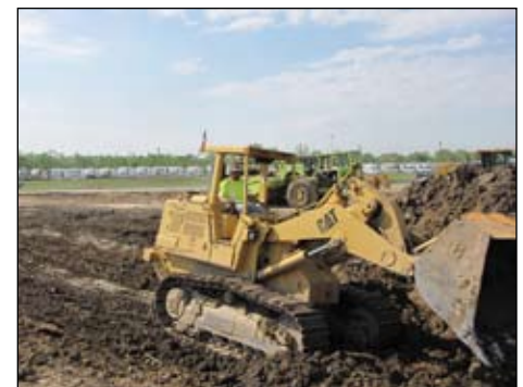
Brad Wood running the loader for Central Engineering.