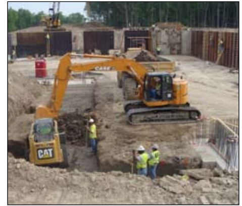
Fox digging the footers on the Orthopedics Northeast project.

Milestone is finishing up on Keystone and working on a bridge job at 700 West, I-70 east of Greenfield, and