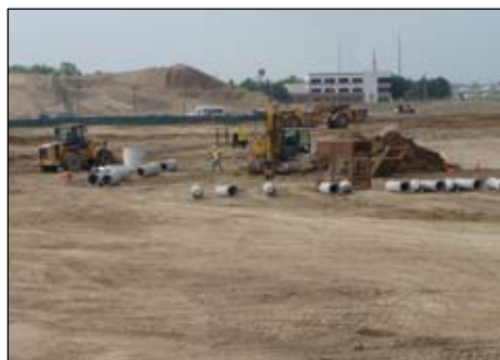
Finally some dry weather to move dirt in.