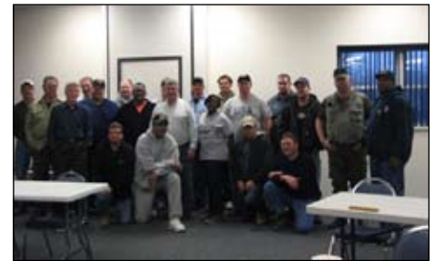
Group photo Hazmat Class 2009.