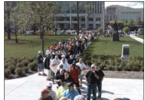
Members show support at the State House Rally.