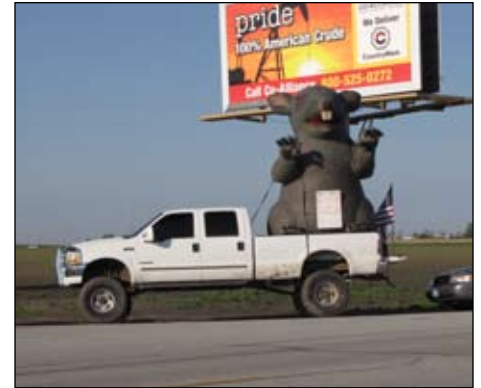
Setting up the picket against Mullen Crane in Remington.